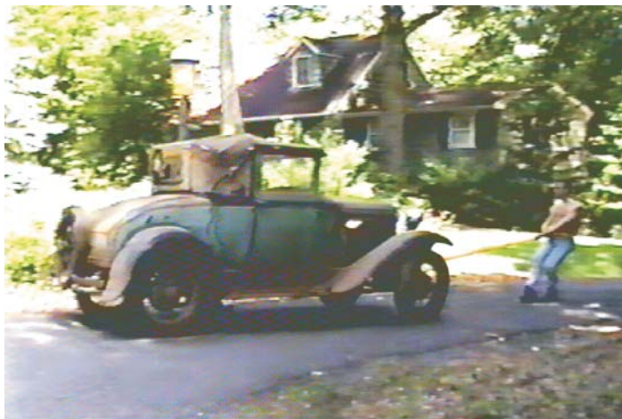
RICK TOWING THE CAR