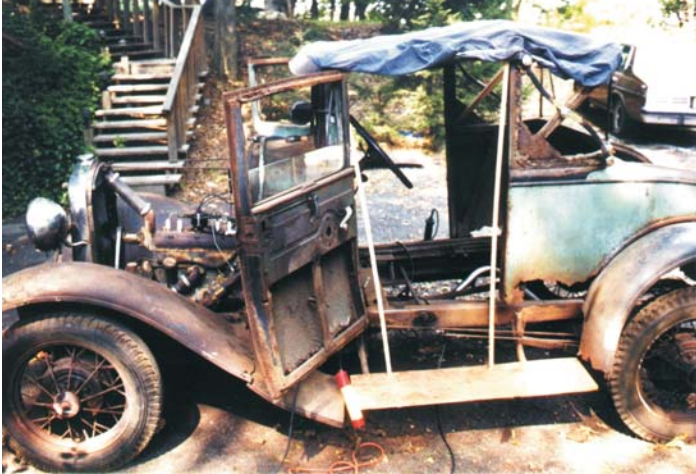
YES, IT DID SLIDE OFF WHEN THE STICKS BROKE

Part 3 of a bunch more. Well, now that we knew the engine ran and the car could move on its own, we decided to start at the bottom. After removing what was left of the seats and floor pans, it became apparent there wasn't much holding the body to the frame, or to itself for that matter. The body rails and cross rails looked like the proverbial "Swiss cheese". We couldn't take the body off as there wasn't anything left on the bottom to hold it together, The only thing left on the top was the wood tack strip above the doors. By placing some 1 x 2s between the plywood running board and the top of the door frame, the body could be supported while we did surgery on the rails. Almost! As the caption says, until the sticks broke. We carefully lifted it back on and replaced the sticks with something a little more substantial. Getting the new side rails in was easy with nothing in the way, the tricky part was figuring out where to mount the piece that kicks up in front to hold the floor boards,. The rear cross member had to go at the back with the rails connected to them. With both sides rusted