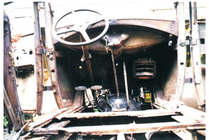
The Interior, Complete with Heater!

Not wanting to struggle any more than necessary, the floor pans were left to a later date. It is a lot easier to work when you can stand on the ground while working inside the car. By cutting away the rusted area of the cowl, it was easy to work