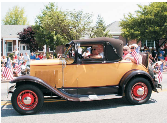
The Bettel Brother's "A"