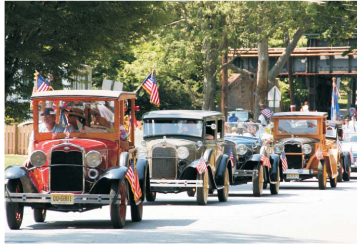
Showing Off the Cars