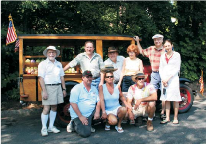
Waiting for the Parade to Start