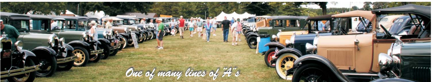
One of many lines of "A"s