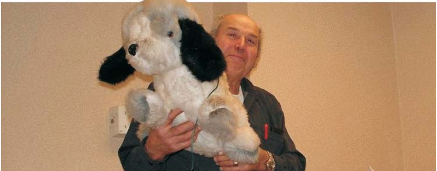
How much is that doggie in the window Lou's Arms?