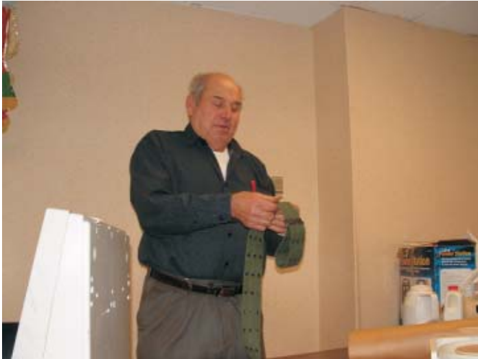
Anyone for a quick BELT?

February 14 th May 9 th August 8 th November 14 th March 14 th June 13 th September 12 th December 12 th April 11 th July 11 th October 10 th 2007