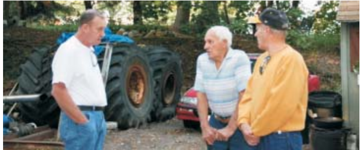
Maybe we can sell these wheels at the auction!