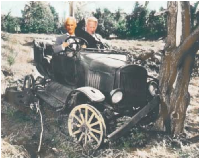
A Fine Mess You've Gotten Us Into This Time!